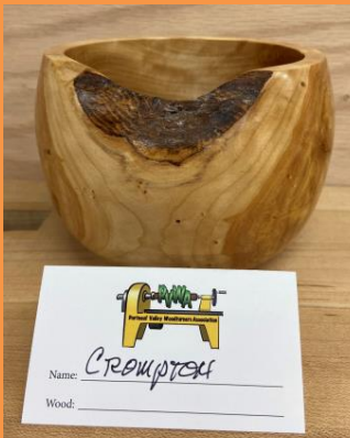
Name: Crompton Wood: