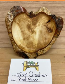
Name: Tracy Casselman Wood: River Birch