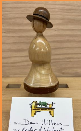
Name: Dan Hillman Wood: Cedar & Walnut