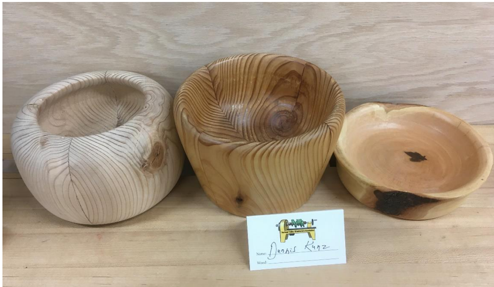
Buz Taysom Boxelder