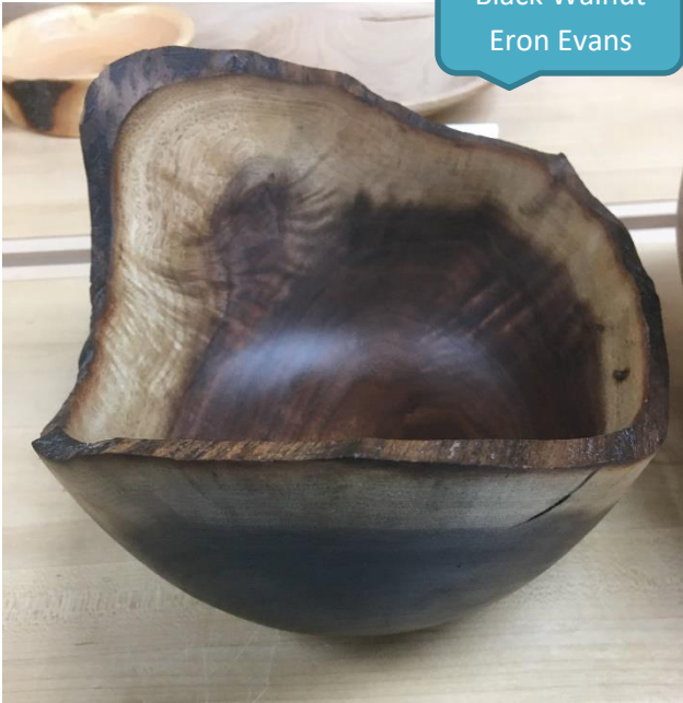
Black Walnut Eron Evans