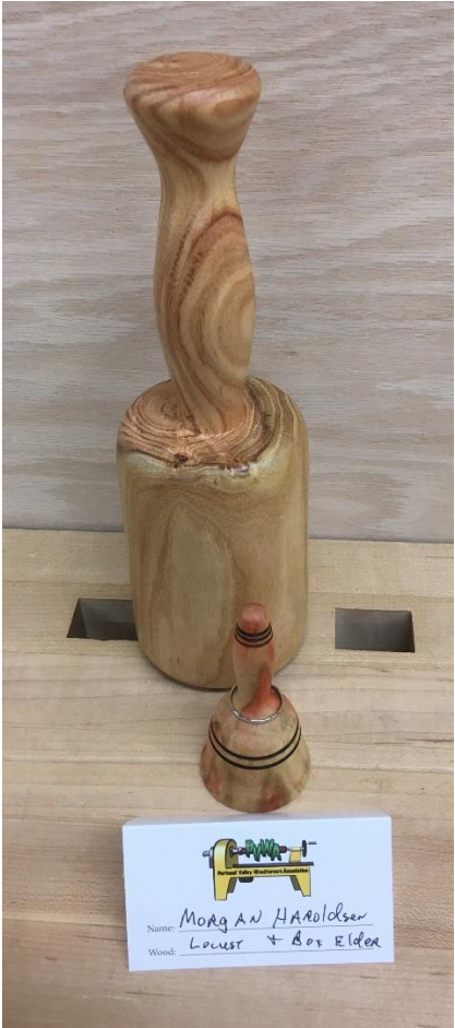
Name: Morgan Haroldson Wood: Locust + Box Elder